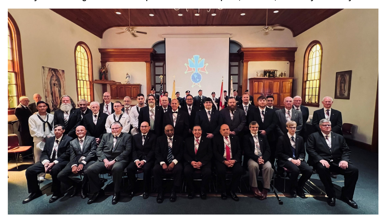
Thirty new Sir Knights attend Exemplification held in Daphne, Alabama, hosted by Assembly 2573